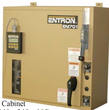
T Cabinet (24" x 24" x 10")